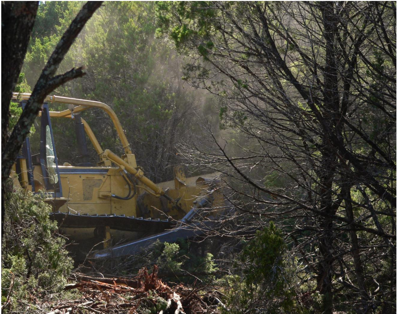
Controlling dense woody stands can get very expensive

for reinvading plants or new colonies. Early detection and spot treatments are the most effective and economical means of controlling invasive vegetation.