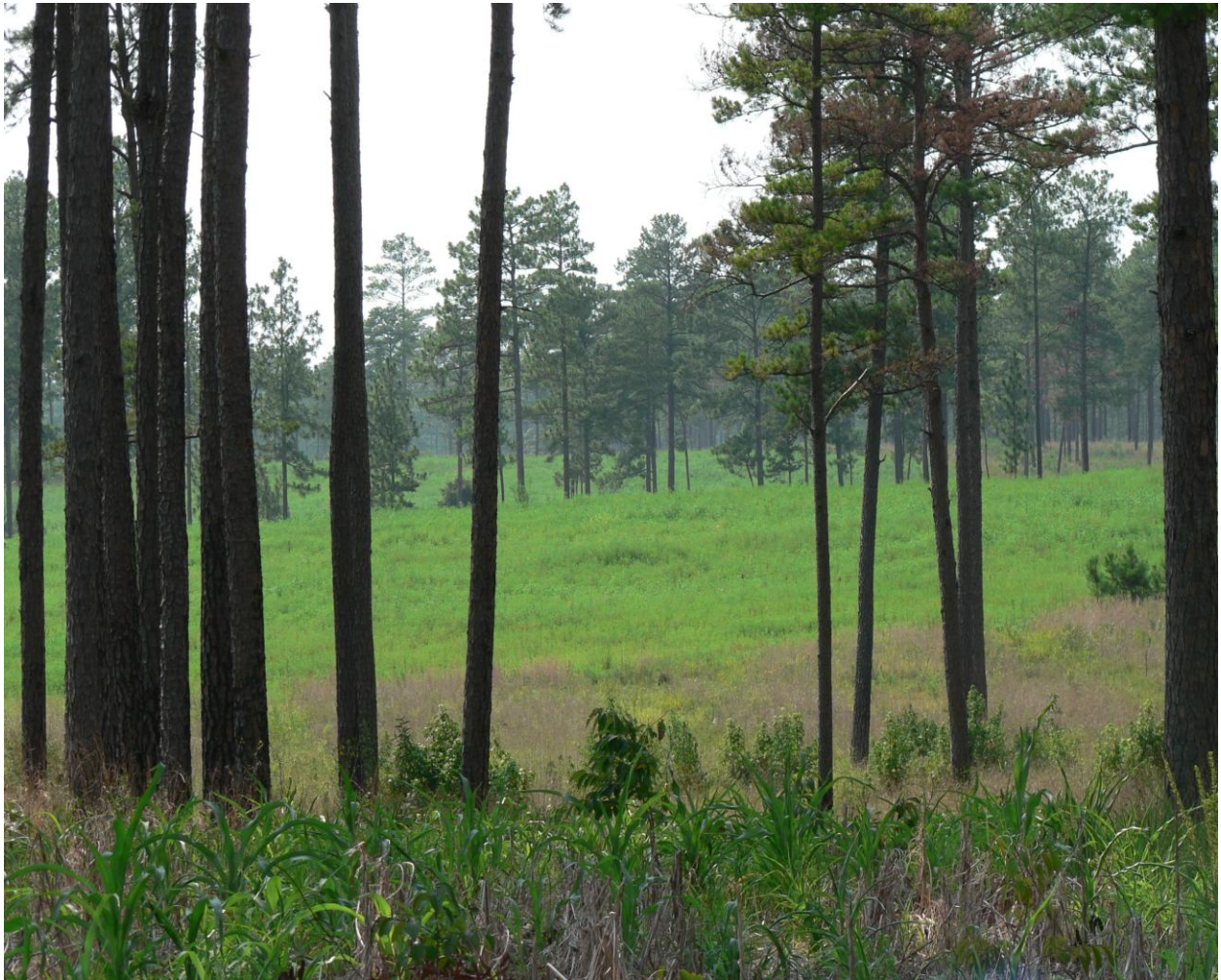
Well managed forest opening

percent of the quail range should be in 3 to 5 acre fields that are evenly distributed throughout the woodland. As a rule of thumb, land managers should aim for one forest opening per 10 to 20 acres. When creating new forest openings, all marketable timber should be harvested from the site. After harvest, fields should be cleared with heavy machinery, making sure stumps and unmarketable timber are piled and burned.