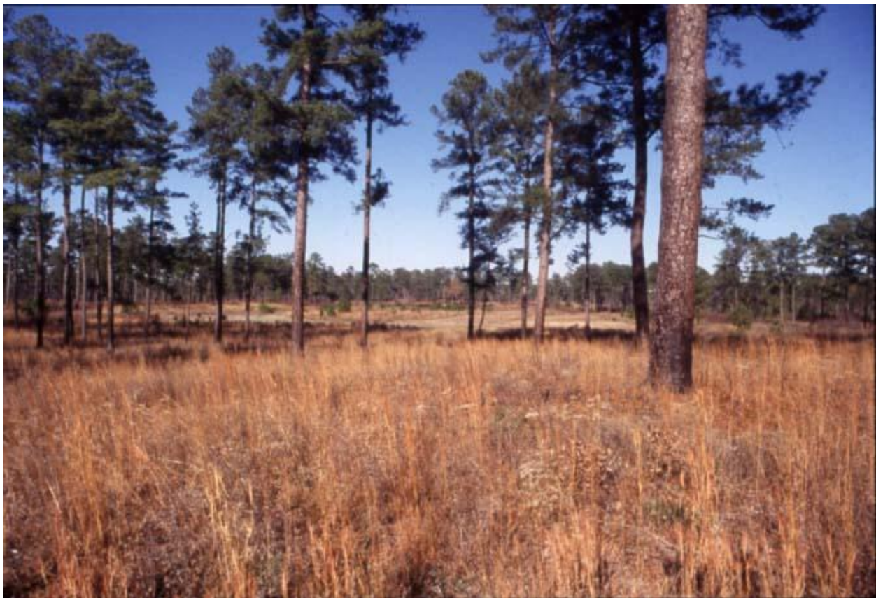
Good example of well managed forested quail habitat

Invasive Plant Control – A variety of nonnative grasses, forbs, shrubs, vines and trees continue to threaten southern pine forests. Invasive, nonnative plants such as Bermuda grass, sericea lespedeza, kudzu, bicolor lespedeza (on some soil types), privet, autumn olive, cogon grass, Japanese climbing fern and tallow tree can infest the forest interior and along woodland edges. Invasive plants hinder forest use and management activities, and degrade plant diversity and wildlife habitat. Invasive plants crowd out important quail friendly plants, negatively impacting habitat structure for quail. Land managers should constantly scout pine forests, interior roads and stream banks for invasive plants. Early detection and immediate treatment are the most effective and economical ways of controlling invasive vegetation. Large-scale infestations will often require a combination of mechanical and chemical applications. In some cases, large-scale conversion of the existing native and invasive vegetation is the only solution. Infested sites should be annually inspected for new colonies. Remnant stands should be spot treated with mechanical and/or chemical applications. Prescribed fire is effective at controlling some invasive plants while promoting the growth and spread of others.