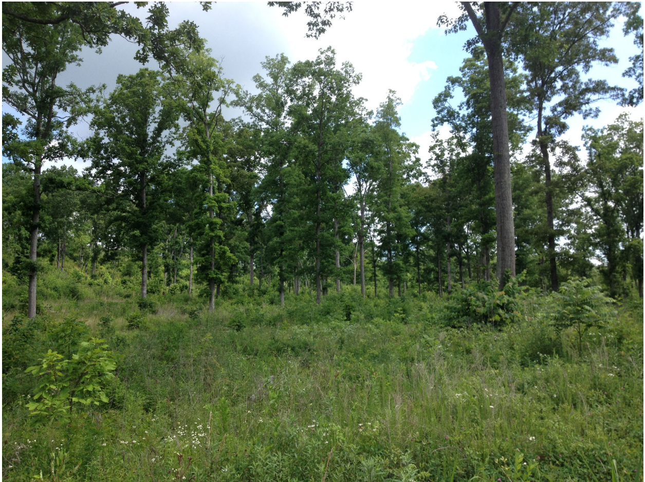
Good quail habitat.

optimum bobwhite habitat, it is essential that the canopy cover remain near or below 40% and prescribed burning occurs on about half the area each year.