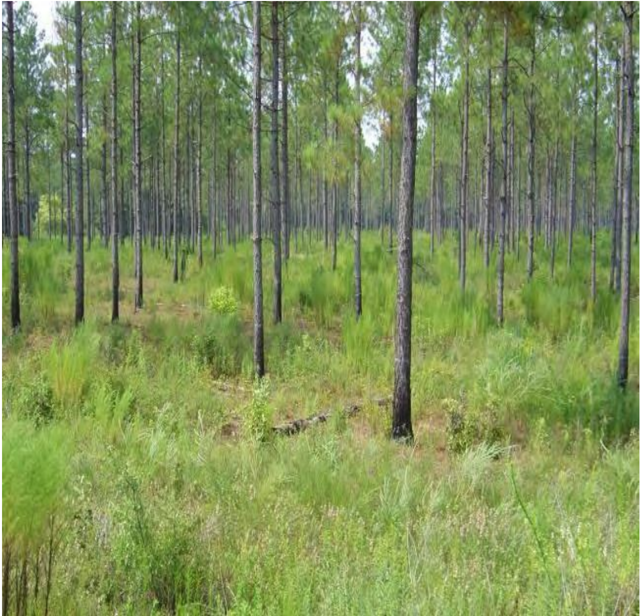
Thinned & Burned, 60-80 ft 2 basal area

This is an acceptable timber stocking for deer, turkeys and other habitat generalists. The increased sunlight coupled with frequent burning results in improved ground cover structure and composition, providing nesting and brooding cover for turkeys and quality forage and fawning cover for deer. Gaps in ground cover are still predominant, which makes bobwhites vulnerable to predation especially during winter months. Ground cover will decrease as tree canopy quickly closes and reduces sunlight with the end result being limited value to bobwhites.