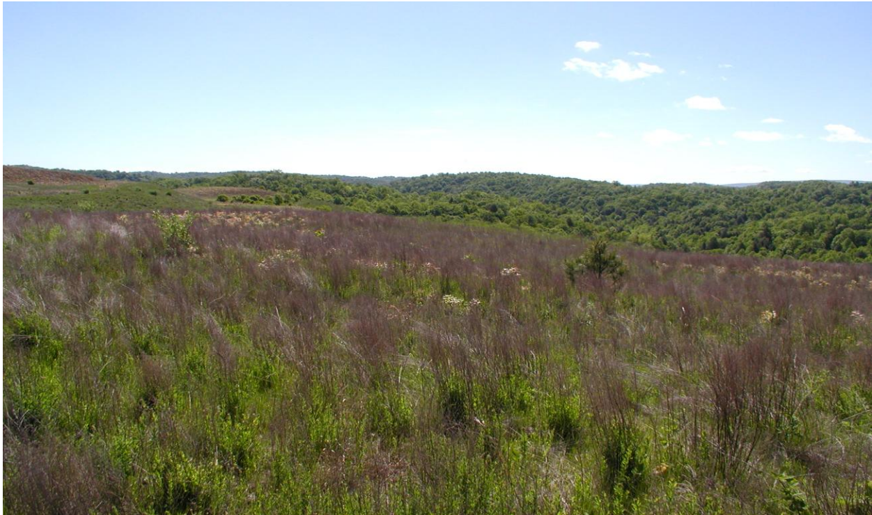
Reclaimed mine site in Virginia with good structure for quail

Selective herbicides such as Imazapyr or Imazapic help reduce weed competition and thereby reduce stand establishment. Warning: as Imazapyr or Imazapic can damage some native grasses and wildflowers. A good stand can be expected by the 3 or 4 growing season depending on weed control measures, site conditions and climate.