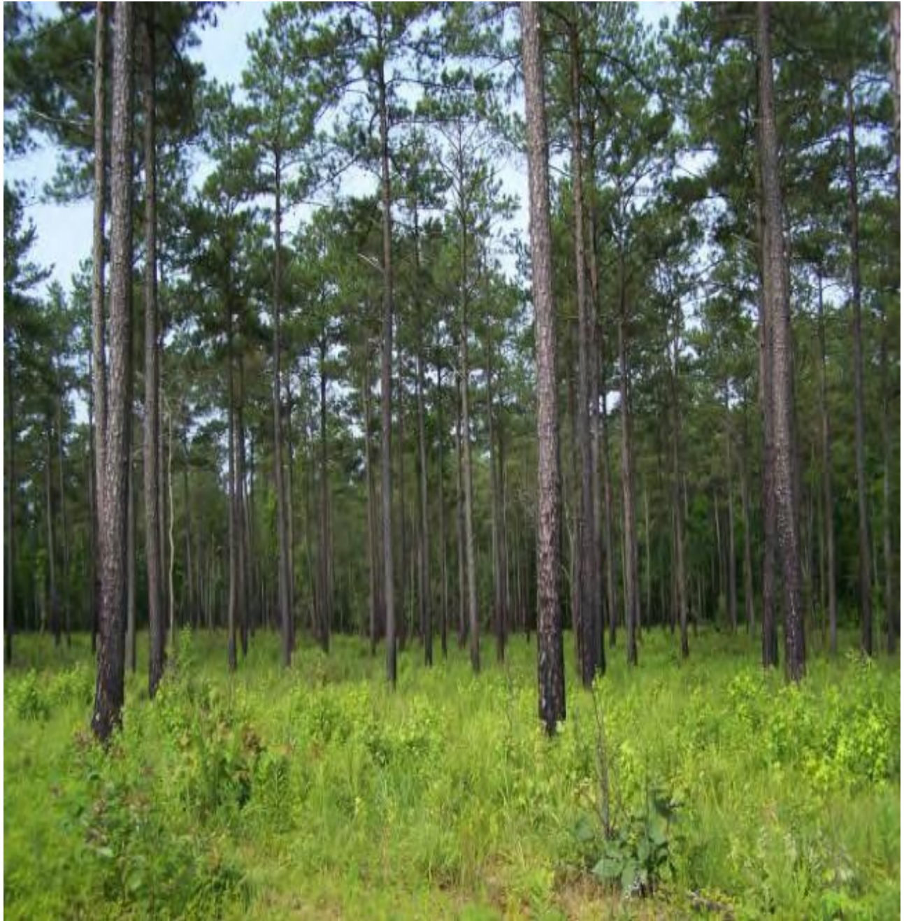
Loblolly Pine Savanna In Restoration – 60 ft 2 basal area and quality timber/bobwhite habitat