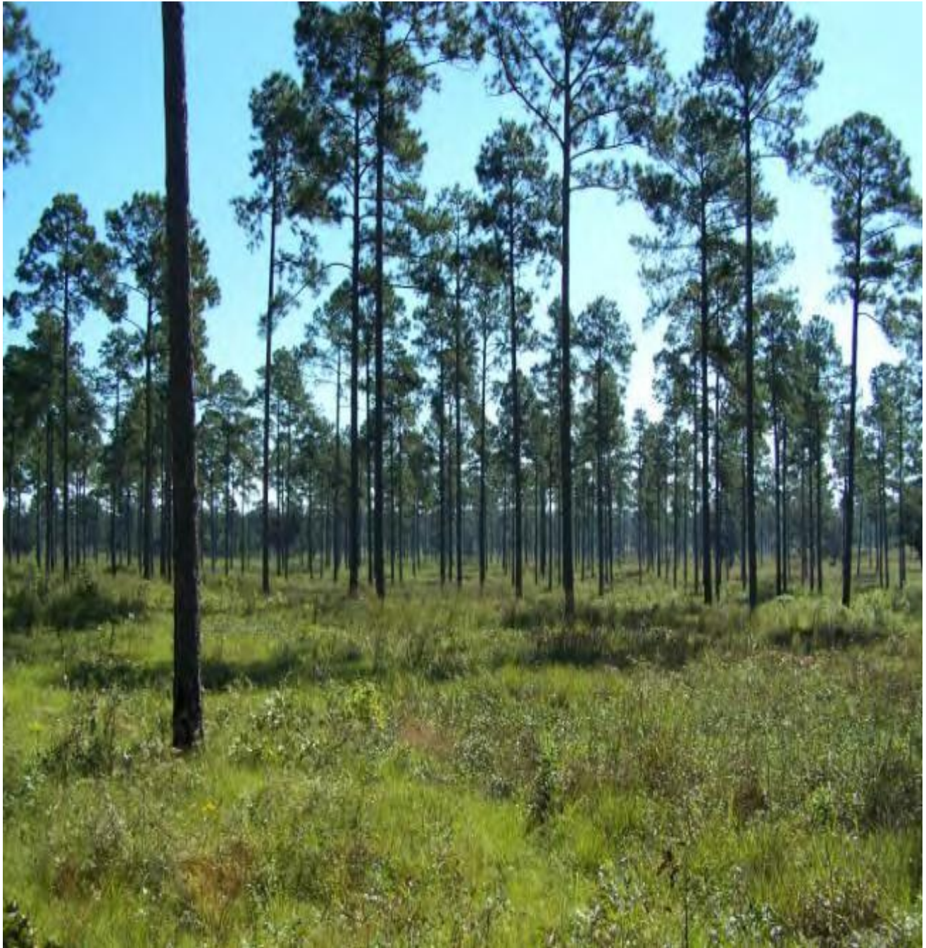
Mature Loblolly Pine Savanna showing intensive bobwhite management with less than 40ft 2 basal area, fallow fields and 2- year fire frequency