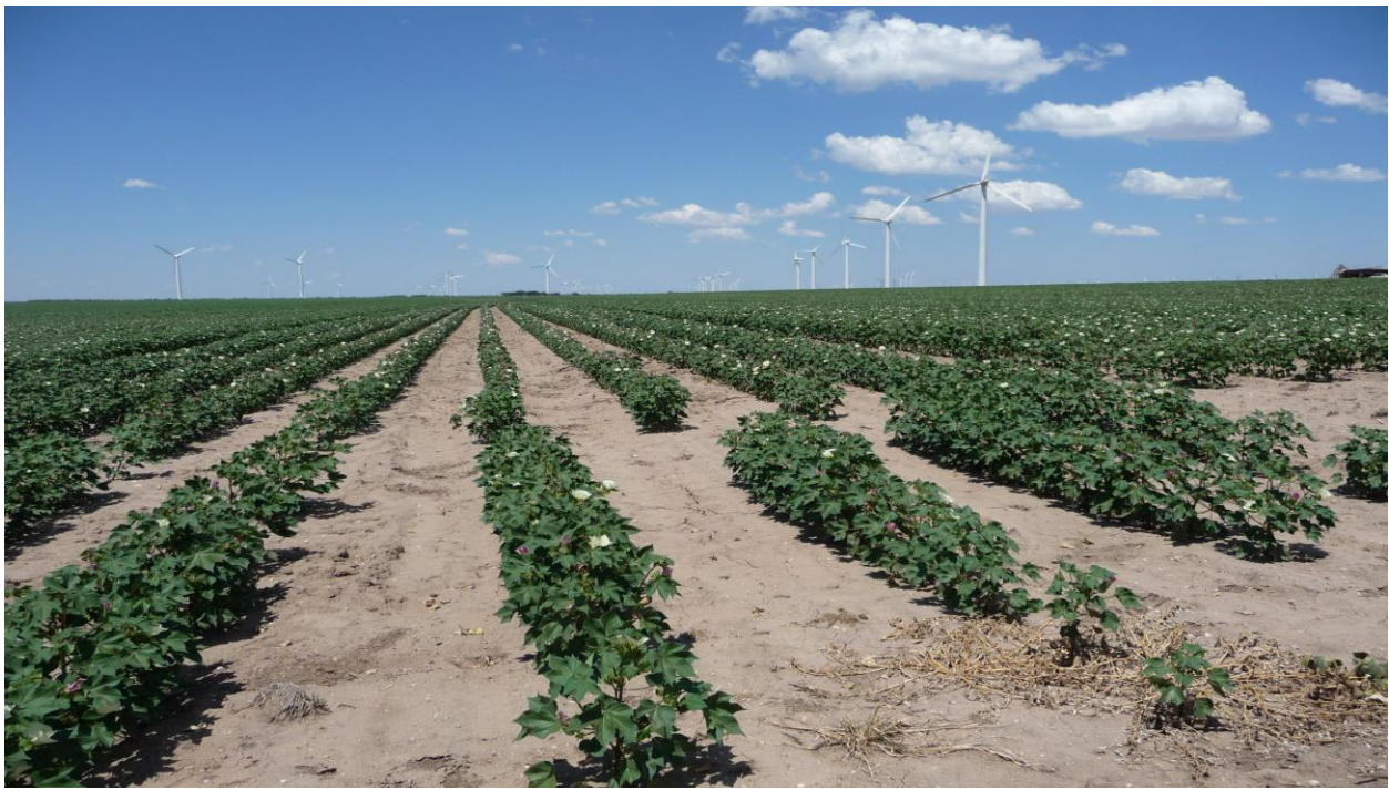
Modern clean farming eliminates nesting and brood habitat

Agricultural Lands - Increase the amount and enhance the quality of nesting, brood-rearing, escape and roosting cover for bobwhites and other grassland wildlife on agricultural lands, through the establishment and/or management of native warm-season grasses, forbs and shrubs.