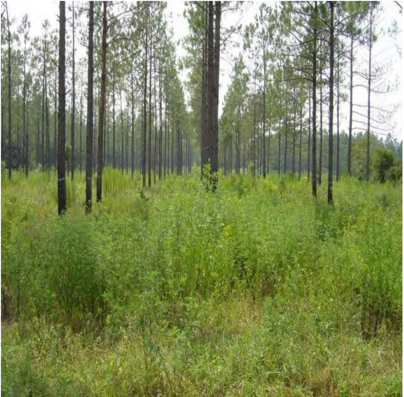
Thinned & Burned, 40-60 ft 2 basal area

These photos exhibit preferred timber stocking for bobwhites and grassland wildlife. Ample sunlight reaches the ground floor to stimulate the desired ground cover while fuel for frequent prescribed burning is provided by native grasses and pine needle litter. This thinning intensity provides multi-season food and cover, and reduces vulnerability to predation. A 2-yr prescribe burn frequency is required for restoration and maintenance of this pine savanna type.