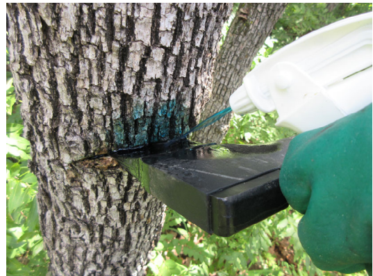
Hack-and-squirt herbicide application.

Another potential herbicide method is a tank mix of Garlon 3A (a low volatility form of triclopyr) and a glyphosate product, which has proven effective in controlling hardwood and pine sprouts following heavy thinning in hardwood stands. Research is ongoing into the long-term effectiveness of this method. The idea is to quickly gain control over sprouts and maximize the effectiveness of prescribed fire. Herbicides can be applied using tractor- or skidder-mounted spray rigs designed to spray in a low arc, covering undesirable understory species without contacting residual overstory trees. Spraying is generally done in late summer the year of thinning.