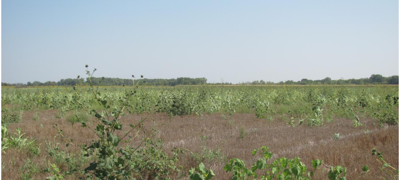
Midwest fallow wheat field with good food and cover for quail

Fallowing – Land managers should consider idling field edges or whole fields for one to five years to provide high quality cover. Fallowing fields is an effective and economical way to provide high quality cover at little or no cost. Idle field borders should be at least 30 feet wide and preferably 60 to 180 feet wide. In most cases idle areas should be allowed to revegetate in annual plants; however a light seeding of annual lespedeza or alfalfa can improve brood-rearing habitat. Land managers interested in maximizing quail habitat should periodically fallow entire crop fields. Fallow field borders and crop fields should be periodically farmed to setback plant succession. To be more effective, fallow areas should be adjacent to shrubby cover.