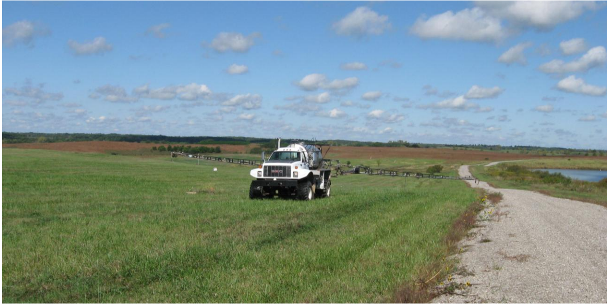
Spraying introduced grass pasture prior to reseeding with natives

The key to establishing native grasses and wildflowers is to prepare a seedbed free of plant competition. Often multiple herbicide applications are necessary if sod forming grasses are present. Specialty herbicides such as Imazapyr or Imazapic (when used in combination with glyphosate) are effective at controlling unwanted vegetation. Land managers may want to consider farming sites for one or two years with glyphosate-resistant crops to eradicate any unwanted vegetation and to reduce costs. This method is commonly used in the Midwest for prairie reconstruction projects, with excellent results.