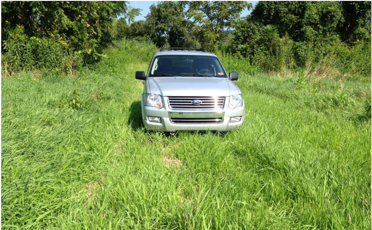
Site invaded by reed canary grass

Livestock Exclusion – Protect idle areas, woodlots, woody draws and food patches from heavy or continuous livestock grazing. Allowing desirable native grasses, forbs and shrubs to develop can provide good nesting, brood-rearing and protective loafing cover along the edges of pastures and hayfields.