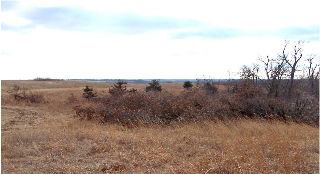
Brushy draws in pastureland settings provide needed cover

Increase the amount of native grass and wildlife-friendly forbs and legume plantings in pastures and hayfields to provide adequate nesting and brood-rearing cover. Delay or modify haying and grazing practices to allow adequate time for nesting and brood-rearing. Enhance shrubby cover and woodland edges for bobwhites.