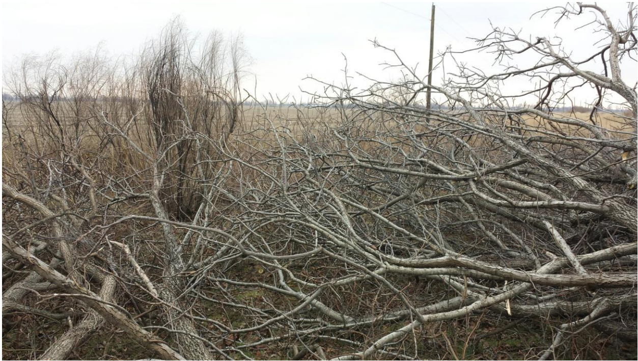
A view of edge feathering from inside tree line

Kill existing grass/vegetation (regardless of type) before edge feathering with an approved herbicide. This provides good growing conditions for annual food plants and shrubs. All trees over 15 feet tall in the area should be edge feathered, making sure native shrubs are left undisturbed. An occasional tree may be left to preserve valuable timber or mast producing species. Generally, treat all cut stumps with an approved herbicide to prolong the benefits of edge feathering. If possible, leave felled trees where they fall. Felled trees may be dropped parallel to the fence line/field edge or cut and loosely stacked along the edge of the field. Do not push the downed trees into a dense brush pile. Edge feathering may be completed with a chainsaw or mechanical clipper.