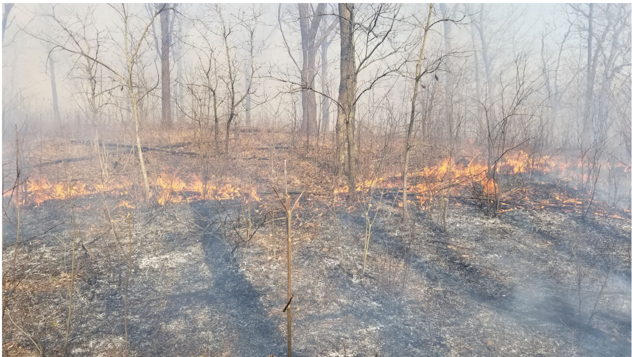
Prescribed burn.

desirable native grasses, legumes, forbs, and shrubs used by quail. As an example, post oak can resprout for decades even with frequent fire, so an initial chemical application such as hack-and-squirt or cut stump treatment may be needed to limit their sprouts. However, quail require some woody cover in the understory. Therefore, scattered patches of plum, sumac, Rubus, and even oak sprouts are beneficial for bobwhites. A balance is needed to maintain enough shrub cover (around 20-30%) and herbaceous cover to meet bobwhite habitat requirements.