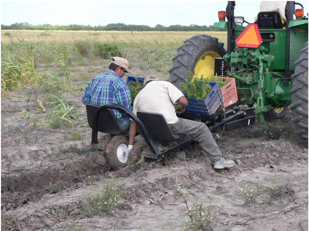
Native shrub planting in a recently farmed field

or cut and loosely stacked along the edge of the field. Do not push the downed trees into a dense brush pile. Edge feathering may be completed with a chainsaw or mechanical clipper.