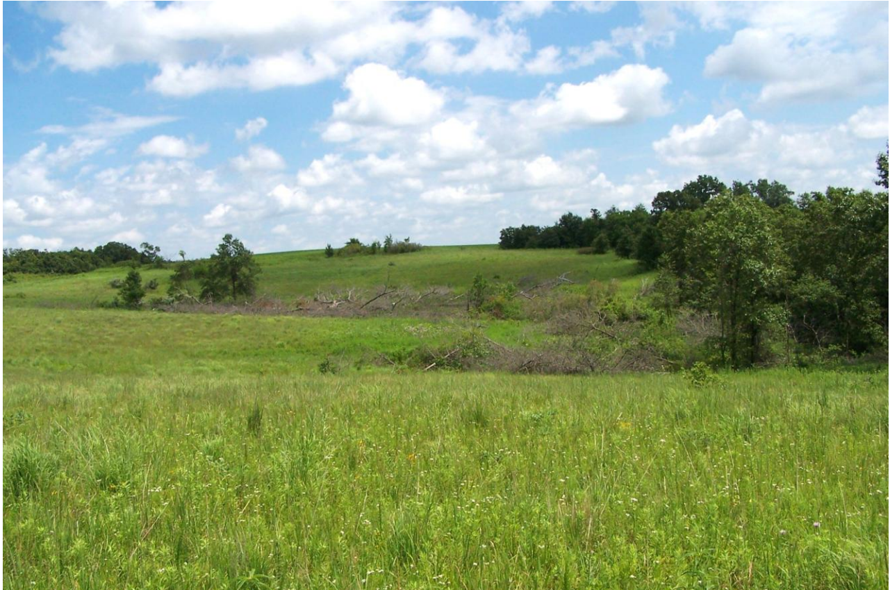
Edge feathering a field

cover should be at least 30 to 50 feet wide and spaced 20 to 100 yards apart. Where quail habitat is the primary objective, crop fields wider than 100 yards should be divided with tree or shrub corridors for maximum bobwhite benefits. Shrub rows should be at least 10 to 30 yards wide. Native shrubs such as wild plum, sumac, shrub dogwood, blackberry and hazelnut make excellent shrubby cover for bobwhites.