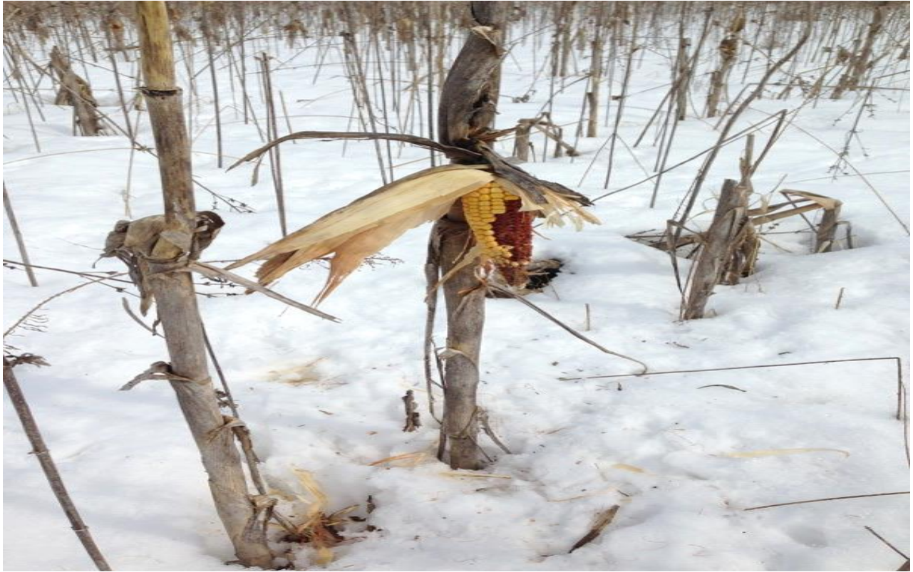
Unharvested corn is available for wildlife even after snowfall but provides little overhead cover

Crop Field Management – Leftover grain, weed seeds and insects are food sources for quail in crop fields. In the summer no-till crop fields provide suitable brood-rearing cover while conventional tilled crop fields with heavy herbicide usage offer poor brood-rearing cover. Land managers should consider adopting no-till farming practices to improve habitat conditions. At the very least, consider using other conservation tillage practices and avoid fall tillage and plowing.