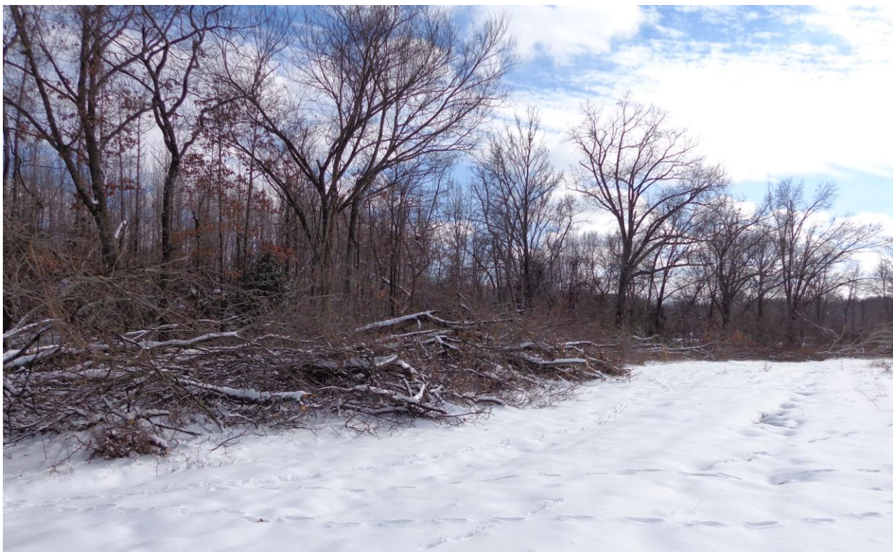
Example of edge feathering

Shrubby Cover Enhancement – During the winter, coveys will often establish a headquarters area and loafing site around one or more shrub or low-growing woody cover sites. Patches of shrubby or woody cover should be spaced 50 to 100 yards apart and at least 30 to 50 feet wide. Where quail habitat is the primary objective, native grasslands and CRP fields wider than 100 yards should be divided with tree or shrub corridors for maximum bobwhite benefits. Shrub rows should be at least 10 to 30 yards wide. Native shrubs such as wild plum, shrub dogwood, blackberry and hazelnut make excellent shrubby cover. Shrubby cover should be fenced from livestock to avoid degrading this important cover type. Land managers should take advantage of continuous CRP marginal pastureland practices such as CP22 Riparian Forest Buffer and CP29 Marginal Pastureland Wildlife Habitat Buffer to establish favorable shrubby cover patches.