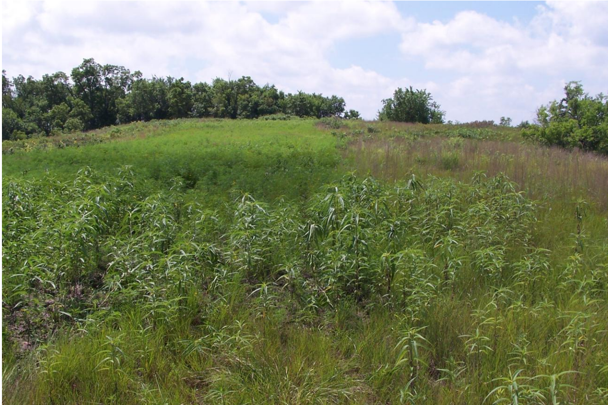
Fall strip disking encourages forb growth

Strip Disking (Wildlife Disking) – Fall or winter strip disking of planted or fallow field borders and idle corners creates a mosaic of disturbed and undisturbed areas. Once the field border is well established disturb 1/3 of the field border or idle areas each year. No more than 1/3 of the area should be disturbed annually since nesting cover is often a limiting factor in agricultural landscapes.