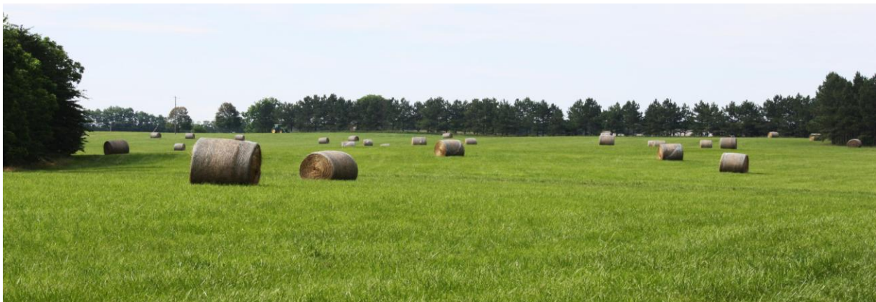
Frequently harvested fescue hay pasture

Pastures and hay fields established to “tame” grasses such as tall fescue, smooth brome, Bermuda grass, and bahia grass provide extremely poor habitat for quail because these forages do not provide adequate structure for nesting and brood-rearing. Current intensive grazing systems using monocultures of introduced grass do not provide adequate nesting cover, plant diversity and bare ground for brood cover. -In addition, most intensive grazing systems are grazed too frequently or at too high stock density for a hen quail to nest, lay 12-15 eggs, and incubate them for 21-23 days without either being trampled by livestock or having all the cover removed. Another common problem is nesting cover may not be located near brooding cover – if successful, a quail may have nowhere to take a young brood after they hatch (consider what biologists learned from the radio collared quail and the fact that a day old quail chick is no bigger than a quarter). -Continuous, severely grazed pastures normally will not provide nesting or brooding cover for quail. -Introduced sod forming grasses also become too dense when rested to allow movement by quail chicks and their lack of diversity provides little in the way of the weed seeds and insects that the chicks need.