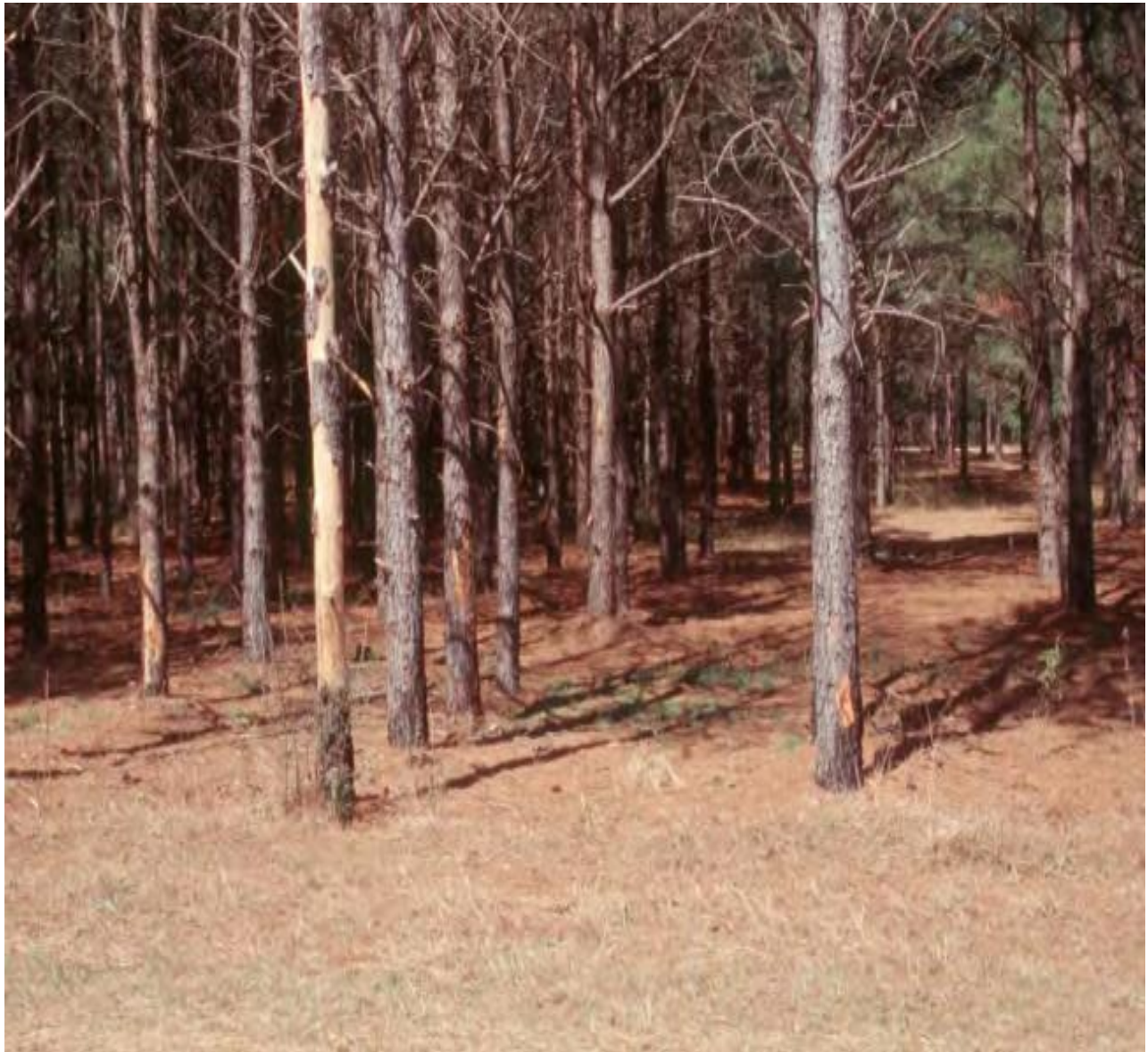
Unthinned & Unburned >120 \text{ ft}^2 basal area

Closed canopy and unburned pine stands represent the greatest management need for bobwhites and grassland wildlife in Georgia. It is critically important to couple thinning with frequent burning. Burning this stand would provide little to no wildlife benefit due to the overstory canopy which prevents sunlight from reaching the forest floor.