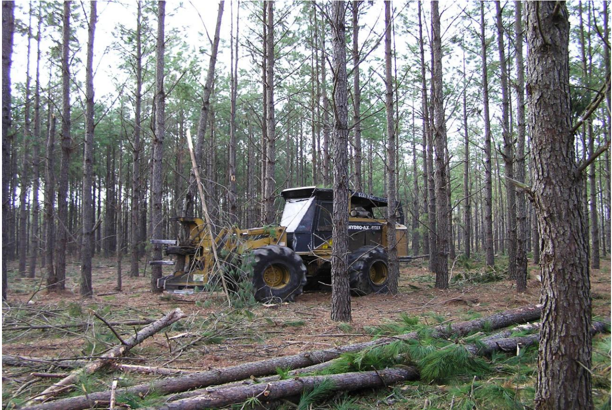
Logging operation