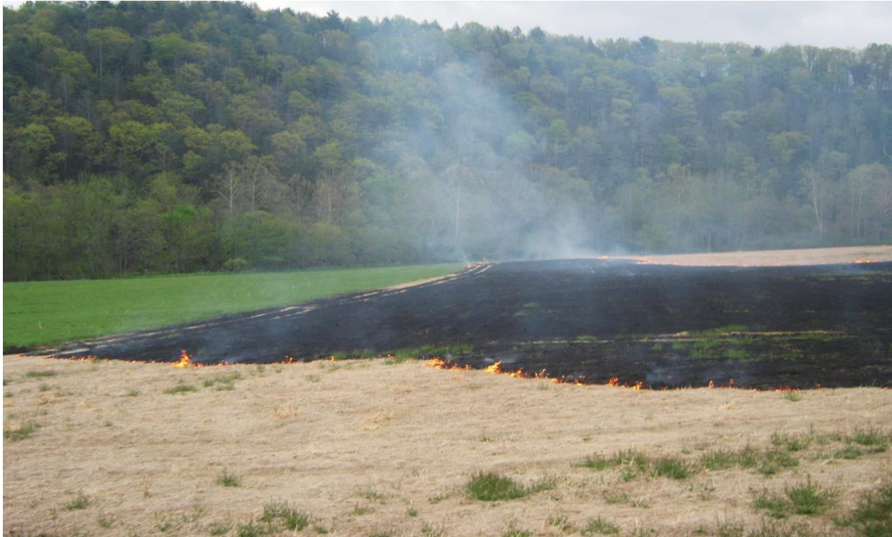
Spring burning can increase usable habitat

Depending on the vegetative cover native grasslands and CRP fields may be burned any time of the year, with the exception of during the spring and early summer nesting season. Land managers should apply fire to the landscape at different times of the year so that portions of fields and grasslands provide suitable cover throughout the year. Excessive burning all at once can negatively impact quail.