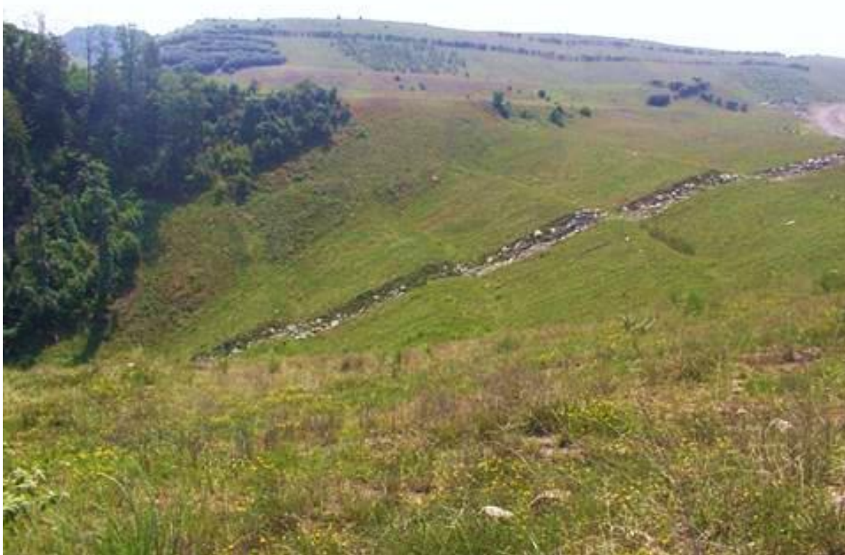
Reclaimed mine valley fill planted in fescue and autumn olive

Invasive Plant Control – Historically, a variety of nonnative and aggressive plants were planted on reclaimed mine lands. In the past, invasive species such as Japanese honeysuckle, sericea lespedeza, tall fescue, autumn olive and black locust were planted. Invasive plants crowd out important quail friendly plants, negatively impacting habitat structure for quail. Depending on management objectives, infested sites should be annually checked for new stands of unwanted plants. However, large-scale control measures may not be feasible due to past management. If left unchecked, invasive vegetation can overtake desirable vegetation and plant structure.