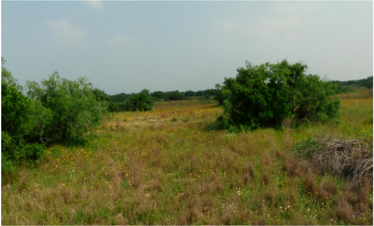
Selected brush removal combined with careful grazing

Land managers interested in enhancing quail habitat should fine tune brush control practices by selectively removing brush across the landscape while maintaining patches of protective woody cover. As a rule of thumb, patches of shrubby cover should be scattered across the landscape with no more than 50 yards between clumps. Species that provide good protective cover as well as seasonal food include sumac, dewberry, shin oak, wild plum, lotebush, sand sagebrush and mesquite. Care should be used in broadcast applications of herbicides for brush control. Many herbicides are nonselective and may eliminate broadleaf forbs critical for seed and insect production and desirable woody loafing and escape cover. Ideally herbicides should only be applied to the targeted invasive species. If that is not feasible consider applying herbicides in alternating strips or crosshatching (think tic-tac-toe) with untreated and partially treated areas left between the treated overlapping junctions.