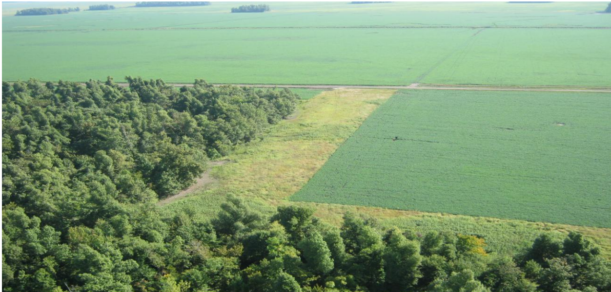
Using native buffers near woods reduce competition with crops

circumstances; proper seedbed preparation, quality seed, proper planting depth, weed control and beneficial weather, native grasses can become established in one growing season. Despite good growth the first growing season, native grasses should not be hayed or grazed during Year 1, unless to achieve a very specific management objective (weed control). If they are grazed it should only be under very controlled circumstances with no more than 50% of their leaf surface area being removed. It is important during the first two growing seasons that native grasses not be over stressed by removing too much leaf surface area during the growing season, since during this time roots are developing. Roots will be fully developed by the end of the second or third growing season and normal use is acceptable at that time.