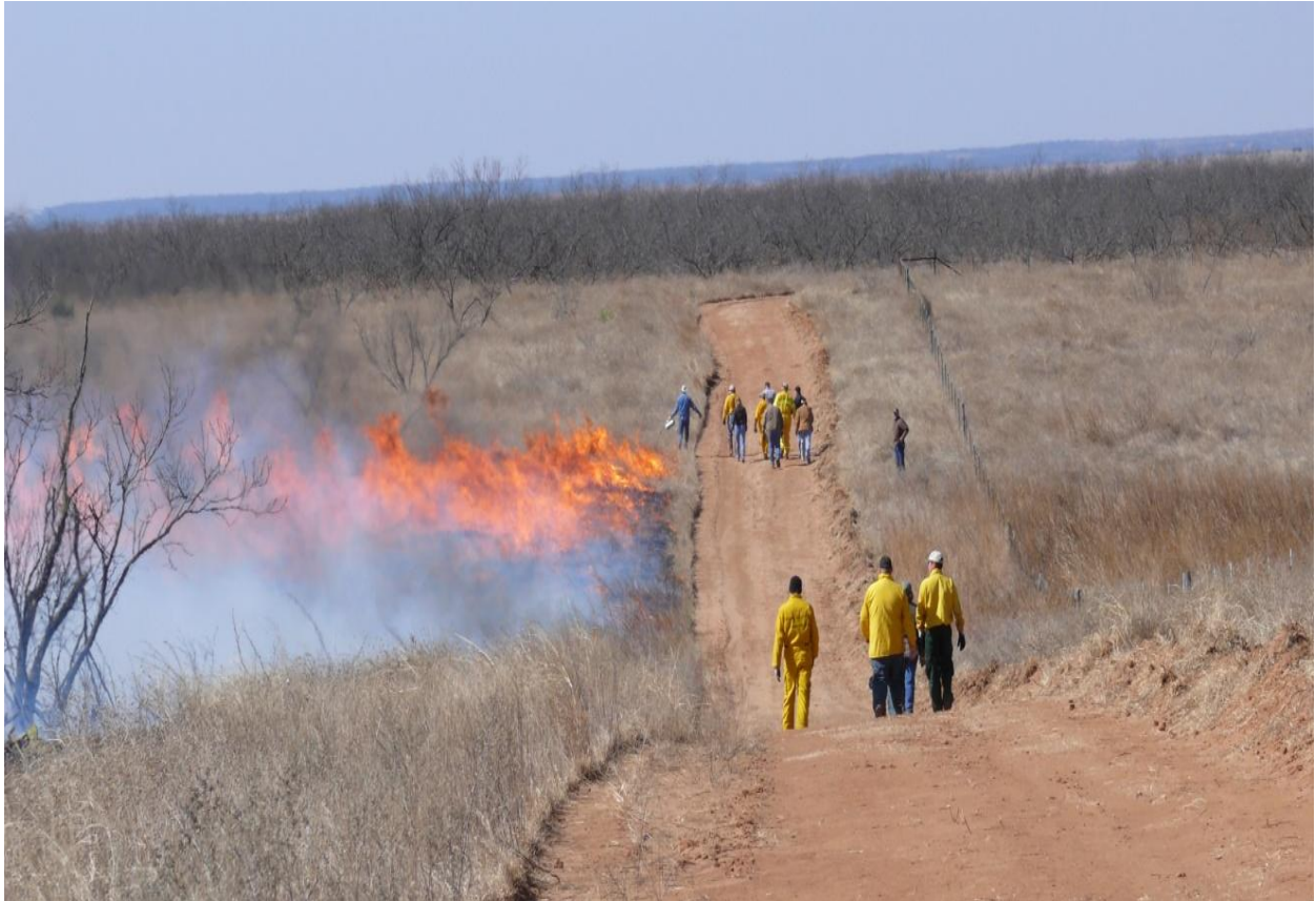
Cool season prescribed burn to invigorate native grass and forb production and reduce invasive mesquite at TPWD's Matador WMA

Prescribed Burning – This is an economical tool to control excessive brush and maintain favorable habitat conditions for quail and forage for livestock in regions of sufficient rainfall (>20"). However, improperly applied large scale burning on native rangelands may negatively impact quail densities by limiting the amount of nesting cover. Larger burns can be performed if they are patchy in nature or contain small 1 to 5 acre upland sites that are left with adequate nesting cover (at least 8-10 inches tall) scattered throughout the burn unit. Care should be taken to protect shrubby escape or loafing cover and other desirable woody plants through the use of fire breaks or black lines. Land managers interested in enhancing and improving quail habitat should avoid annual burning on the same acreage. Burning on a two to six year rotation is generally recommended based on climate, soil fertility and grazing rotations. Prescribed burns from late winter to "green-up" provide the most benefit for native warm season grass stands. May-September burns are preferred for controlling invasive woody species although winter burns are also effective at reducing woody plant cover. Young stands of non-sprouting species such as eastern red cedar and Ashe juniper are most effectively managed with prescribed fire, whereas resprouting species including mesquite and red berry juniper will require maintenance treatments. Early winter burns, after the first frost, are best for