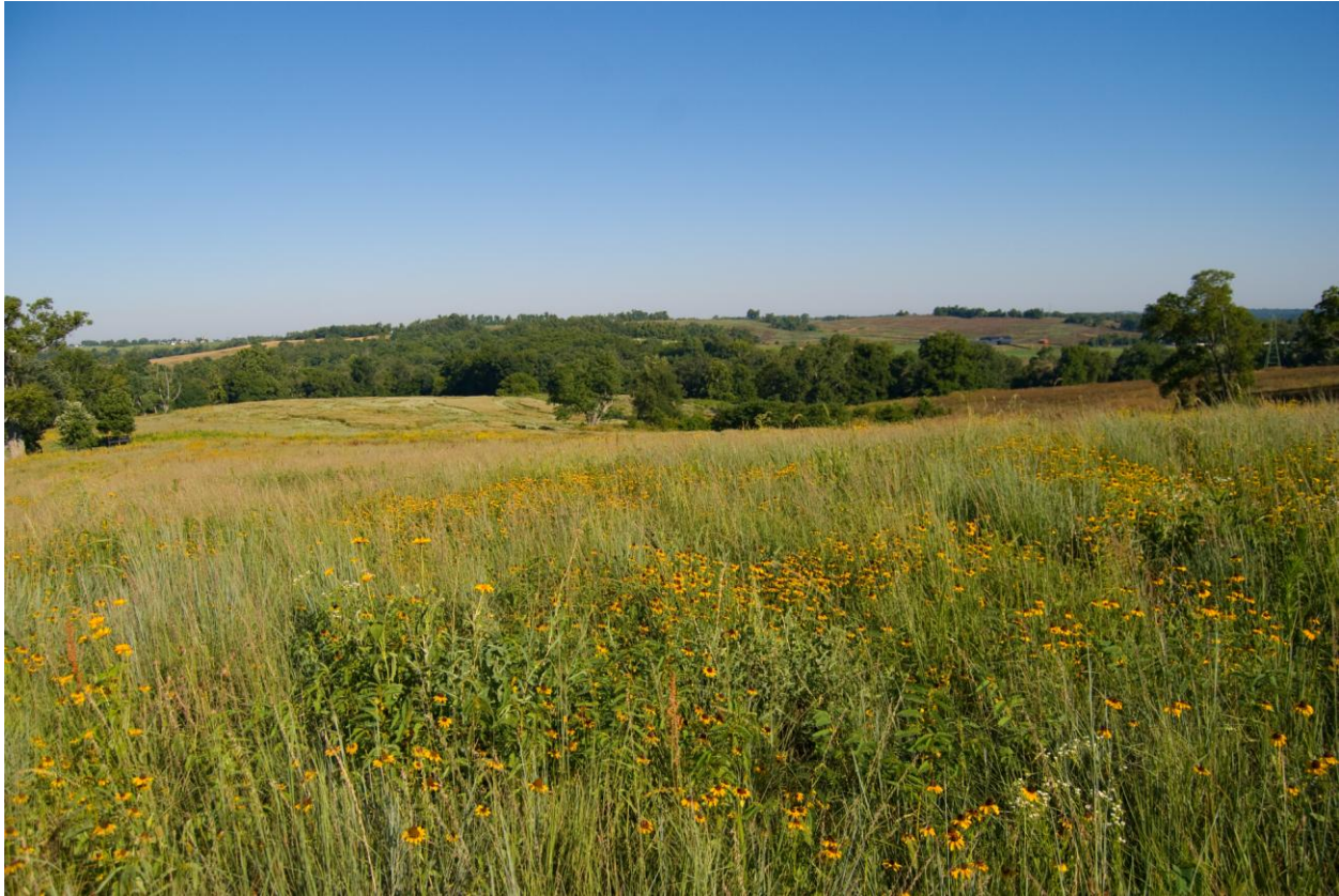
Lighter seeding allows greater forb diversity – photo by Ben Robinson, KDFWR

Light seeding rates (3 to 5 PLS pounds of seed per acre) are preferred over traditional, heavy native grass seeding rates (8 to 12 PLS pounds of seed per acre). Lighter rates provide more room for native wildflowers, legumes and annual seedy plants such as ragweed and croton. Shorter native grasses such as little bluestem and broomsedge are preferred over taller native grasses such as big bluestem, Indian grass and switchgrass for a variety of reasons. “Shorter” native grasses and low seeding rates provide better habitat structure (the interspersion of nesting and brood-rearing cover together) and they may require less frequent disturbances from prescribed fire or strip disking than sites established with “taller” grasses at heavy seeding rates. Establishing a diverse mix of native wildflowers and/or legumes improves plant diversity, thereby attracting more insects and creating better habitat structure. Below are some suggested native grasses and wildflower seeding rates for Midwest field borders. Species and rates can vary a great deal across the bobwhite’s range, so consult local experts on what is best in your area. Heavy seeding rates may be required on other buffer practices.