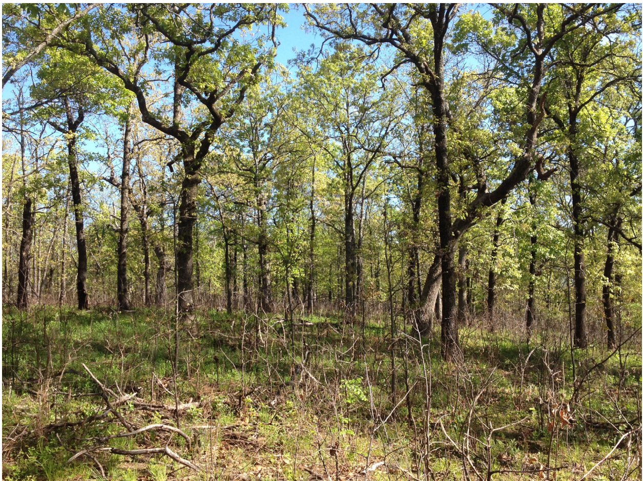
Marginal habitat for quail.

Restoring the site – To benefit bobwhite and other species with similar habitat requirements, an initial thinning and/or harvesting of overstory trees must be implemented to create an open canopy. An initial thinning can speed up the restoration of woodland, sometimes by several decades. Prescribed fire is also essential to restore and maintain woodland. Prescribed burning