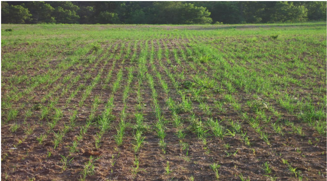
Sprayed twice and burned before planting

The key to establishing native grasses and wildflowers is to prepare a seedbed free of plant competition. Often multiple herbicide applications are necessary if sod forming grasses are present. If desirable native vegetation such as bunchgrasses and wildflowers are present consider managing the existing stand instead of establishing more native grasses. Remnant stands can be rescued by eradicating undesirable cool-season grasses with glyphosate in the fall after a killing frost or by applying selective herbicides during the growing season. Make sure to read and follow label directions when applying herbicides. It is difficult and expensive, if not impossible to salvage native vegetation on sites infested with exotic warm-season grasses.