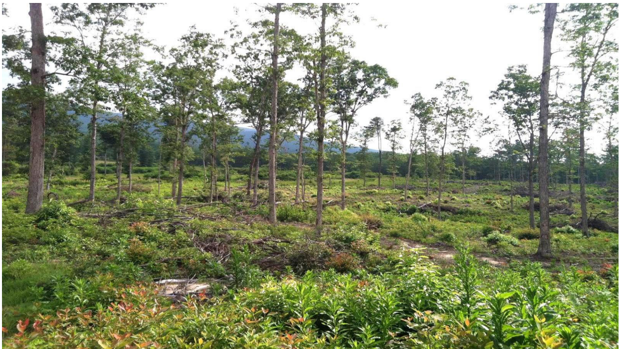
Recently heavily thinned woodland.

Thinning – A variety of silvicultural practices can be used to restore degraded oak and pine-oak woodlands. As a general rule, woodland sites should have no more than 60% canopy cover , and even this level is very marginal for northern bobwhites. To provide optimum conditions for northern bobwhite, canopy cover should be less than 40% . Woodland canopies should be evaluated at mid-day and measured when leaves are on the trees. An open overstory and a sparse mid-story are critical to promote native grasses, forbs, and legumes for cover and food resources. Whether a commercial timber harvest is to be completed or not (some areas do not have viable commercial timber markets), before undertaking an over-story removal, trees that are to be retained should be marked to ensure that whoever is completing the tree removal work is aware of what is to be taken and what is to be left.