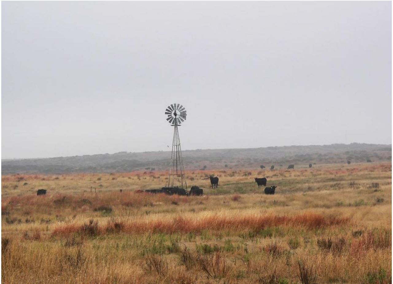
Well managed native rangeland – photo by Chuck Kowaleski, TPWD

Land managers interested in enhancing and maintaining habitat for quail should consider conservative stocking rates, especially in areas of low annual rainfall, in order to maintain this mix of good vegetative structure. Research indicates nesting quail select areas with taller, denser grass clumps. Cattle should be deferred from rangelands when native bunchgrasses are reduced to less than 200 clumps per acre and/or are less than 8 inches tall. Grazing strategies that maintain at least 700 grass clumps/acre over 10 inches tall are ideal. On rangelands where the species composition does not currently support desired grasses for nesting cover, more intensive restoration methods may be needed. These include specialized grazing management designed to restore mid and tall grasses – such as multi pasture single herd rotations (4 Pasture – 1 Herd), complete destocking of livestock for a period of time, control of invasive grasses or woody species, reseeding native grass species and brush management. If a suitable density of desired grass species exists, then a lower level of grazing management may suffice to maintain the desired density of ground cover. Periodic destocking may still be necessary to maintain desirable nesting cover depending on local conditions.