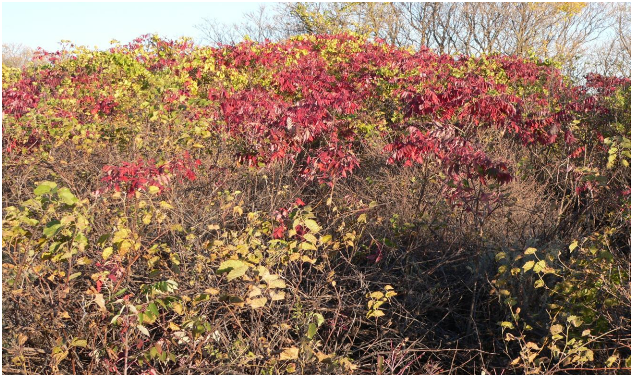
Flame leaf sumac thickets make great escape/loafing cover

Buffers infested with cool-season grasses can easily be improved by a well-timed fall or early spring herbicide application. Buffers infested with invasive warm-season grasses can only be improved for quail by eradicating all existing vegetation, including native grasses and wildflowers. Native grasses and wildflowers can be reestablished once the invasive vegetation has been eradicated. To prevent future reinfestations, land managers are encouraged to spray areas adjacent to the field border and underneath trees and shrubs. Use of a boomless sprayer is an effective way to target invasives in these areas.