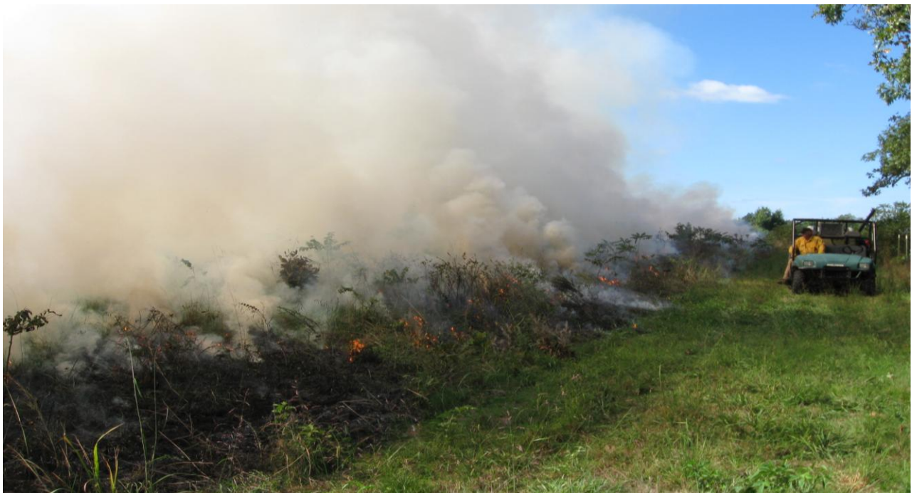
Using prescribed burning to maintain a field border

If desirable native vegetation such as native grasses and wildflowers are present consider managing the existing stand instead of establishing more native grasses. Remnant stands can be rescued by eradicating undesirable cool-season grasses in the fall after a killing frost or by applying selective herbicides such as Imazapyr or Imazapic on introduced warm season grasses during the growing season. Make sure to read and follow label directions when applying herbicides. It is difficult and expensive, if not impossible to salvage native vegetation on many sites infested with exotic warm-season grasses.