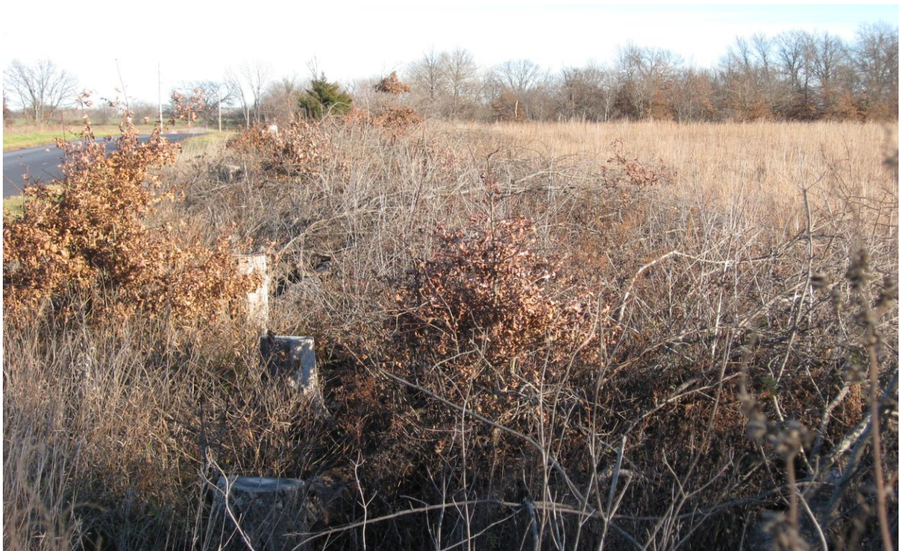
Cut down mature trees in woody fencerows to enhance cover

Woody Draws and Small Woodlots – Hedgerows, woody drainages and small woodlots provide critical shrubby cover for quail. Over time, shrubby draws and fencerows have grown up into mature trees with an understory of sod forming grassing such as tall fescue, smooth brome or Bermuda grass. Cut down mature trees in woody fencerows, hedgerows and drainages to enhance native shrubs and low-growing woody cover. Spray around and underneath trees prior to cutting to remove sod forming grasses. This practice is also known as “edge feathering” or “chop and drop”. Renovated edges should be at least 30 feet wide and 1,500 square feet in