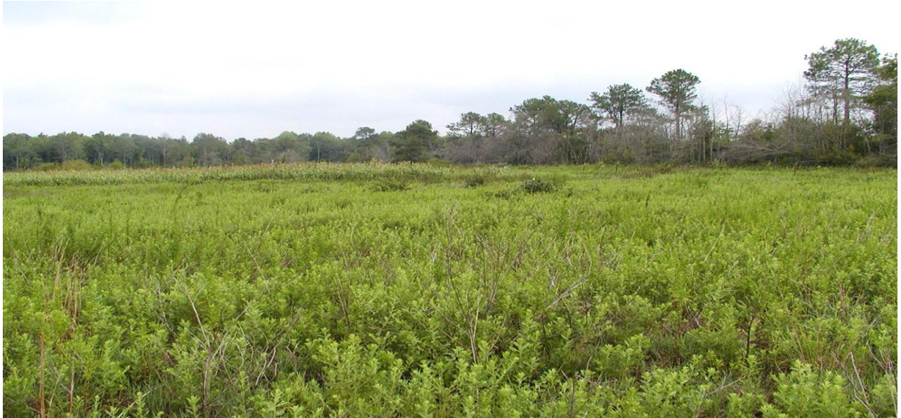
Southeast fallow field with good annual plants overhead cover - photo by Billy Dukes SCDNR

Fallowing – Land managers should consider idling field edges or whole fields for one to five years to provide high quality cover. Fallowing fields is an effective and economical way to provide high quality cover at little or no cost. Idle field borders should be at least 30 feet wide and preferably 60 to 180 feet wide. In most cases idle areas should be allowed to revegetate in annual plants; however a light seeding of annual lespedeza or alfalfa can improve brood-rearing habitat. Land managers interested in maximizing quail habitat should periodically fallow entire crop fields. Fallow field borders and crop fields should be periodically farmed to setback plant succession. To be more effective, fallow areas should be adjacent to shrubby cover.