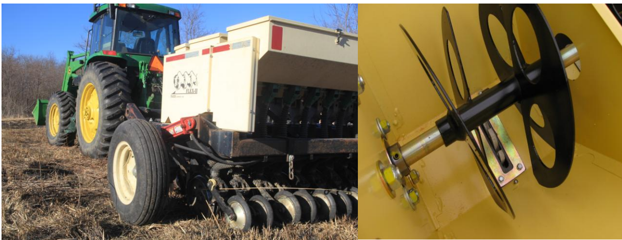
A special planter, often with multiple seed boxes and an agitator that allows the use of fluffy seeds, is needed for planting many native grasses and forbs

Native grasses and wildflowers may be established during the dormant season or spring. The light, fluffy seeds will require special seeding equipment or unique seeding methods such as the winter planting shown in Scott James', Quail Forever photo below to effectively distribute the seed across the field. Good results can be expected when seeds are broadcast or planted with a no-till drill if proper seedbed preparation and adequate rainfall occur. Newly established native grass and wildflower plantings should be periodically mowed to a height of 6 to 10 inches during the first year to reduce weed competition and promote their growth. Warning: Mowing should not be used as a long-term management practices as mowing does not create favorable habitat conditions and plant structure for quail. Selective herbicides can help reduce weed competition and thereby reduce stand establishment. Warning: Imazapyr can damage some native grasses and wildflowers. A good stand can be expected by the 2, 3 or 4 growing season depending on weed control measures, site conditions and climate.